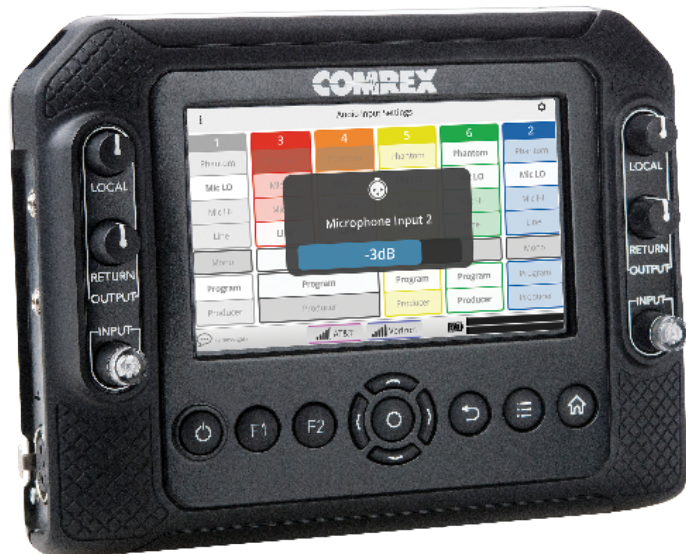
ACCESS NX Portable