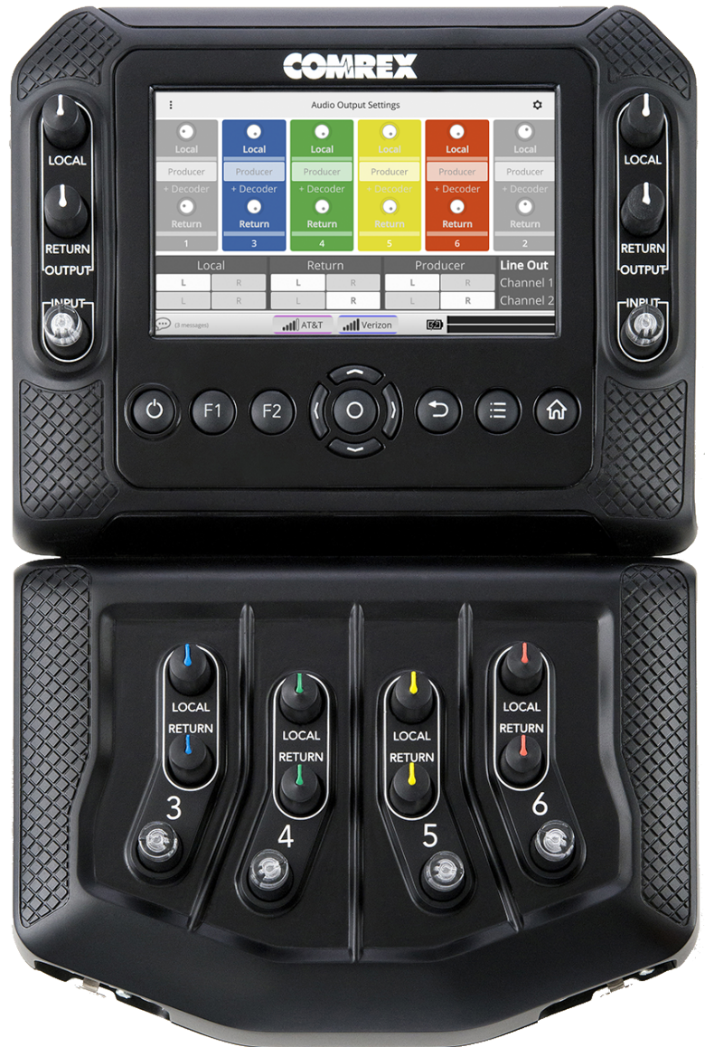
ACCESS NX Portable with optional 4-channel mixer